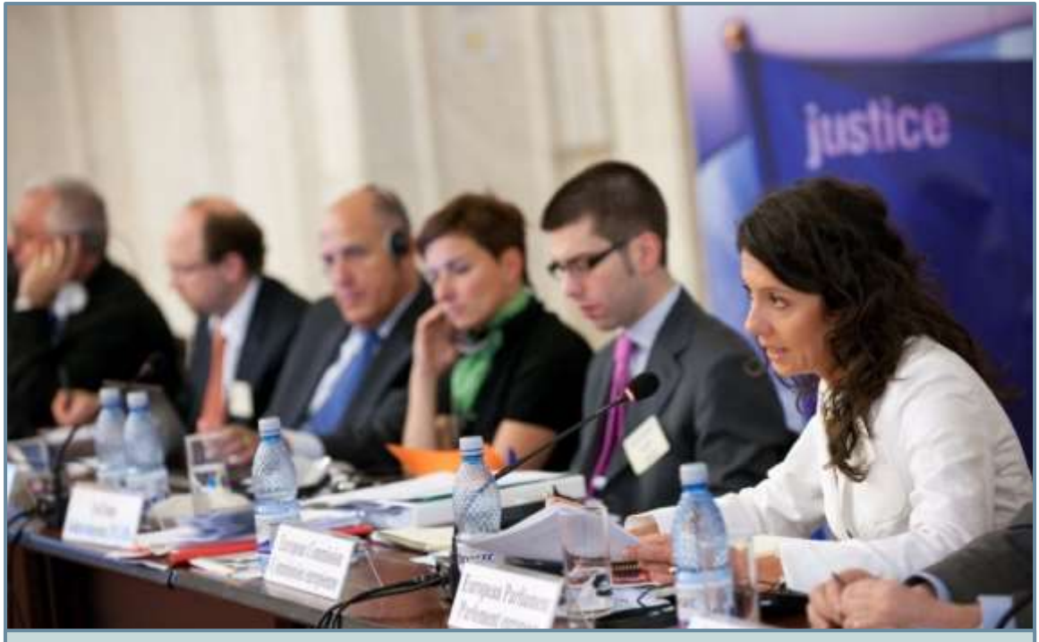
The European Parliament taking the floor at the ENCJ General Assembly in Bucharest

The ENCJ can look back with pride on its achievements since its formal establishment and looks forward with new ideas in continuing its role in furthering the common area of justice for the benefit of all citizens.