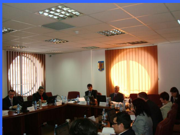
The SCM Plenary session on 3 rd of March 2011

The commissions have regularly meetings, usually once a week and they give consultative endorsements to the most important works of the Council.