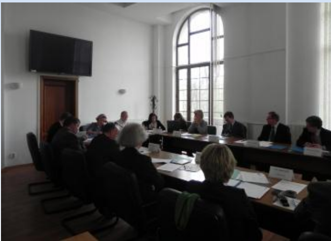
The meeting of the ENCJ project "Quality and Timeliness", Bucharest, 11-12 April 2011

The Council will be represented within the General Assembly of ENCJ from Vilnius, 8-10 June 2011.