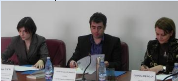
Concluding the Collaboration Agreement between the Council, the European Institute of Romania and the Governmental Agent for ECHR, Bucharest, 6 th of April 2011

The publishing activity of court decision was delayed due to upgrading at the end of 2010 of the ECRIS software (case management system). Court decisions are integrated within the JURINDEX by using ECRIS, and subsequently specific instruments for protection of personal data are operated.