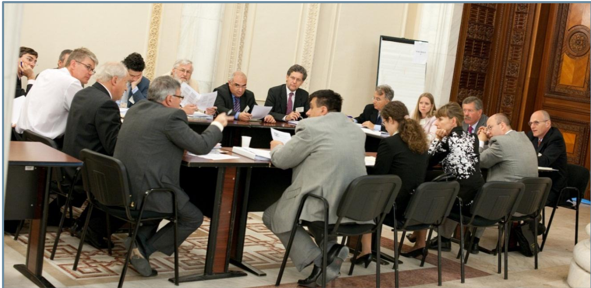
ENCJ in discussion