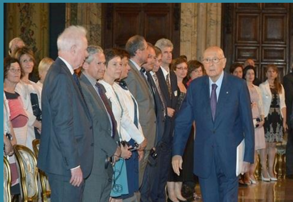
Opening reception of the 2014 General Assembly in Rome hosted by President Napolitano