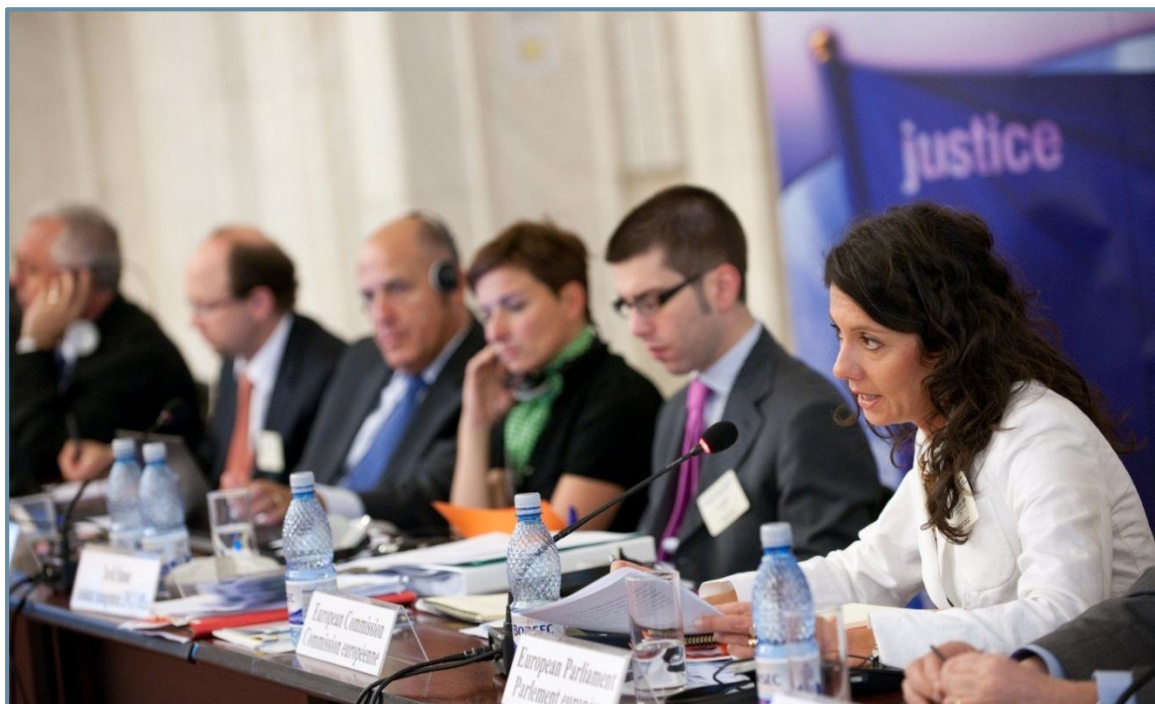
The European Parliament taking the floor at the ENCJ General Assembly in Bucharest

The ENCJ can look back with pride on its achievements since its formal establishment and looks forward with new ideas in continuing its role in furthering the common area of justice for the benefit of all citizens.