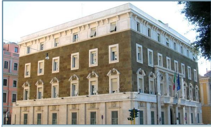
Consiglio Superiore della Magistratura at Piazza dell'Indipendenza, Rome, Italy

The Council for the Judiciary organisations are in various ways responsible for the support of the judiciary in the independent delivery of justice. Characteristic for all organisations is their autonomy and their independence of the executive and legislative power. Although there are different structures for ensuring judicial independence all Councils nevertheless are governed by the same general principles. Some Councils are competent with regard to career decisions for judges, selection, recruitment and evaluation and disciplinary actions whereas other, in general more recently established Councils have competencies that include policy and managerial tasks in the fields of efficiency and quality, budget and budgeting procedures.